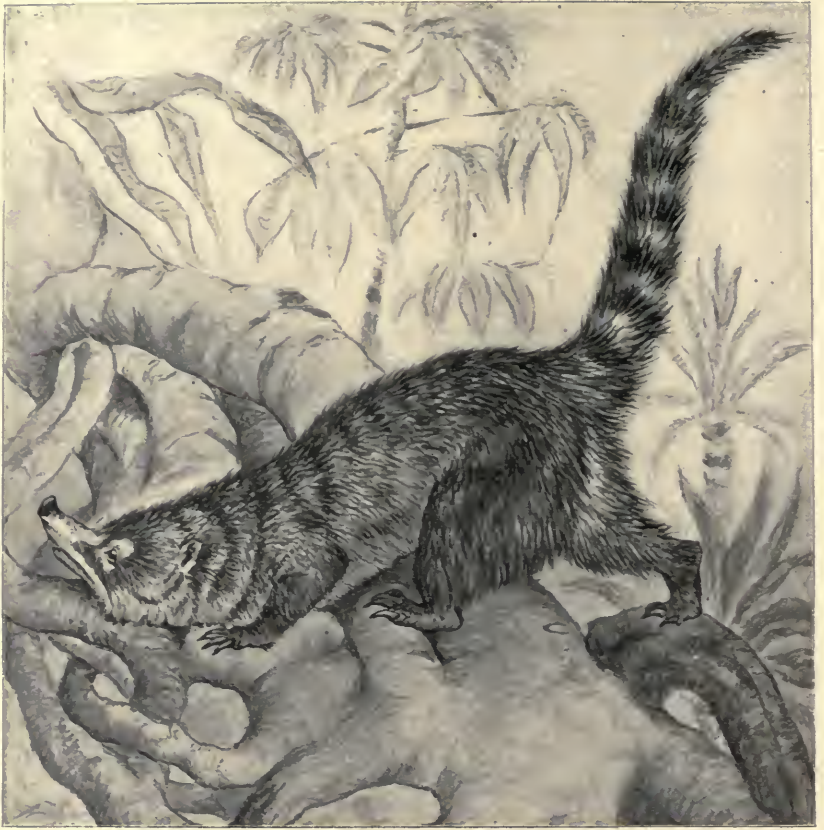
FIG. LII. NASUA NASICA. COATI.